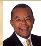
Henry Louis Gates Jr